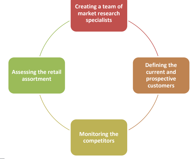
Fig. 2. Elements of the system of creating retail assortment

The process of sustainable development of the retail assortment is based on pre-made sales forecasts for separate stock categories. In this aspect, the amount of retail space that needs to be allocated for each stock category, as well as the number of assortment positions or Stock Keeping Units (SKU) that must be purchased for each category have to be determined. In turn, the amount of retail space depends on the selected trade format. Kotelnikova Z. defines the 'trade format' as a product of optimization of such parameters as price and assortment of goods, retail space, provision of trade services while taking into account the characteristics of location and the behaviour of consumers and competitors [5, p. 154-155]: See Fig. 1.